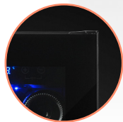
FULL GLASS DOOR