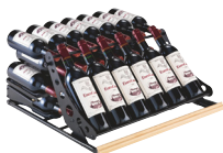
1 AOPRESAR + 1 ACMS 32 bottles capacity*