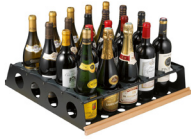
1 ACVH + 1 ACMS 20 bottles capacity*

* NOTE : Maximum capacity of 14 bottles at the bottom of the wine cellar