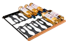
6 ACMS 12 bottles capacity*