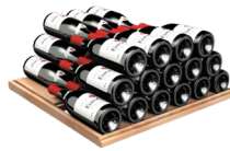
3 AXUH 32 bottles capacity*

* NOTE : Maximum capacity of 14 bottles at the bottom of the wine cellar