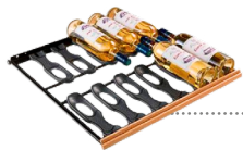
14 ACMS 12 bottles capacity*