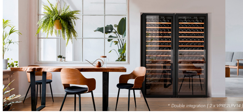
* Double integration ( 2 x VPRE2LPV14 )