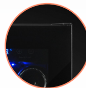
FULL GLASS DOOR

* Capacities are approximate and calculated with bordeaux bottles type.