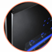
FULL GLASS DOOR

* Capacities are approximate and calculated with bordeaux bottles type.