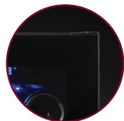
FULL GLASS DOOR