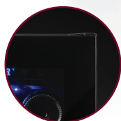
FULL GLASS DOOR