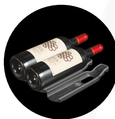
Main du sommelier