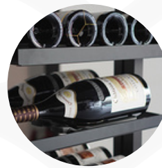
Capacity of 96 bottles type bordeaux tradition*