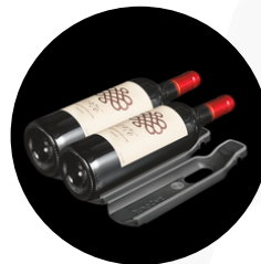
Main du sommelier